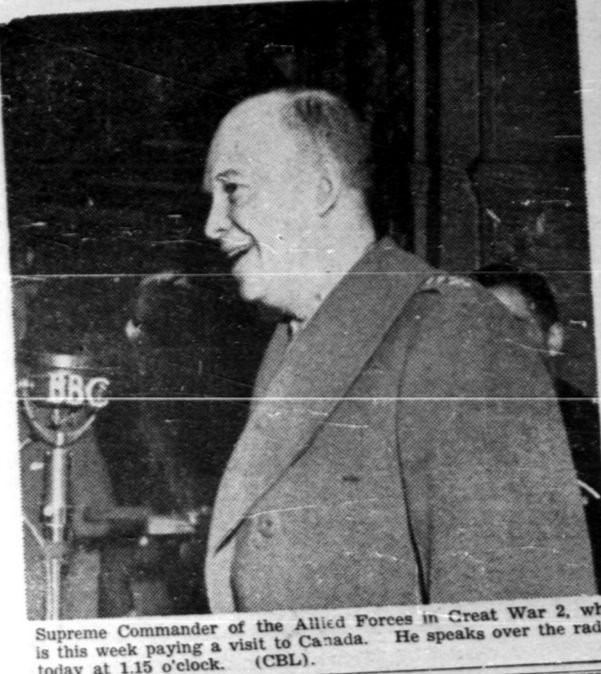
Supreme Commander of the Allied Forces in Great War 2, who is this week paying a visit to Canada. He speaks over the radio today at 1:15 o'clock. (C.B.L.)