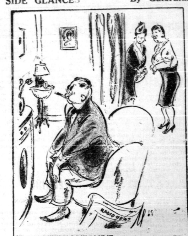
"Since he's retired he's always worrying about something—during the war it was the invasion, and now he's following three different serials!"

And Worth It A Kansas City man visited a banker the other day and asked, "Are you worried about anything I can meet my vote next month for?"