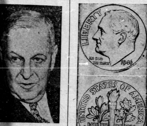
Rear Admiral Husband E. Kimmel, commander of the Pacific Fleet at the time of the Jap attack Dec. 7, 1941, is pictured above in characteristic pose as he read a 30,000-word defense statement to the congressional Pearl Harbor investigating committee.