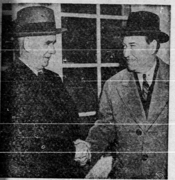
Philip Murray, left, CIO president and head of the United Steel Workers, and Benjamin Fairless, president of the U. S. Steel Corporation, shake hands during amiable meeting in Washington.