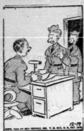
"He says he's a bigamist and he wants two furloughs!"

From Missouri A doctor's telephone rang one night, awakening him from fitful slumber. It was one of his regular patients, a man in a wild state of alarm.