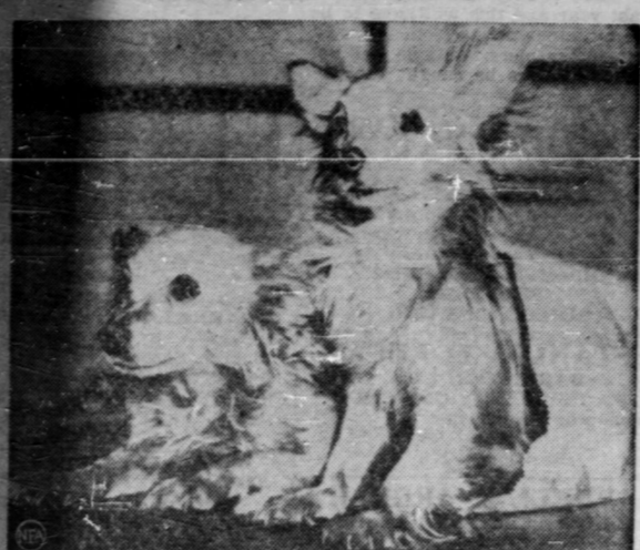
Peeking out of a paper sack at a cold, cruel world, these Pomeranian pups look longingly for someone who will provide a home.