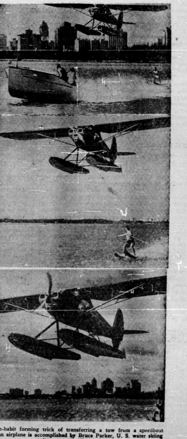
Non-habit forming trick of transferring a tow from a speedboat to an airplane is accomplished by Bruce Parker, U. S. water skiing champ, at 70 miles an hour.