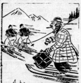
"In summer he chases ambulances!"

Barometer Was Right A man on the coast of Florida wrote to a New York store for a barometer. When it arrived he unpacked it and discovered that the instrument was set at "Hurricane."