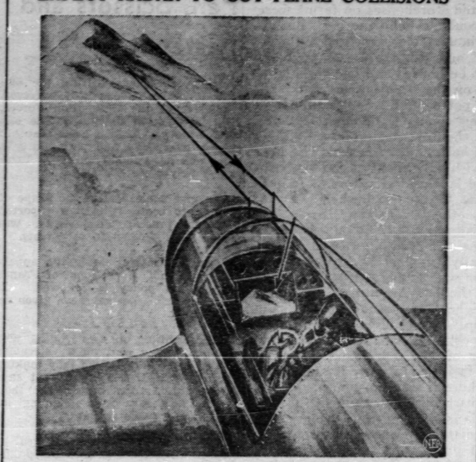
Soon to be standard equipment of passenger airplanes and airport control towers will be the magic eye of radar which "sees" through poor visibility to give warning of dangers ahead.