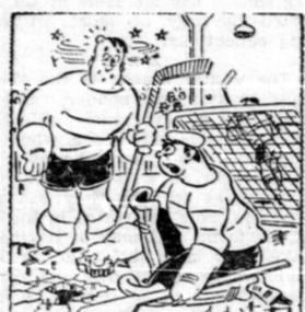
"I wish you'd be more careful where you put your head!"

Scores A well-known bishop was just home in England after a long stay at one of our distant colonies. Broad in mind as well as physique he was strolling round the crowded London streets.