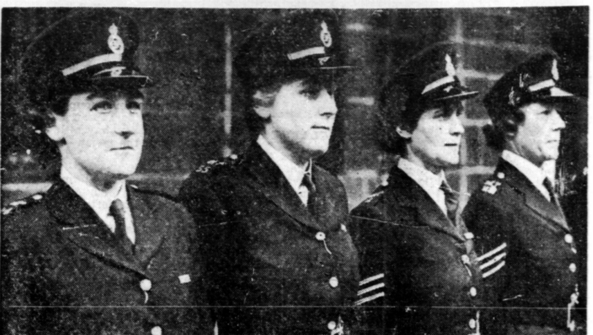
New hats for London's women "Bobbies" were worn for the first time at the Victory parade last month. They take the place of the old-style helmet which was regulation costume for years. Policewomen model the hats at New Scotland Yard.