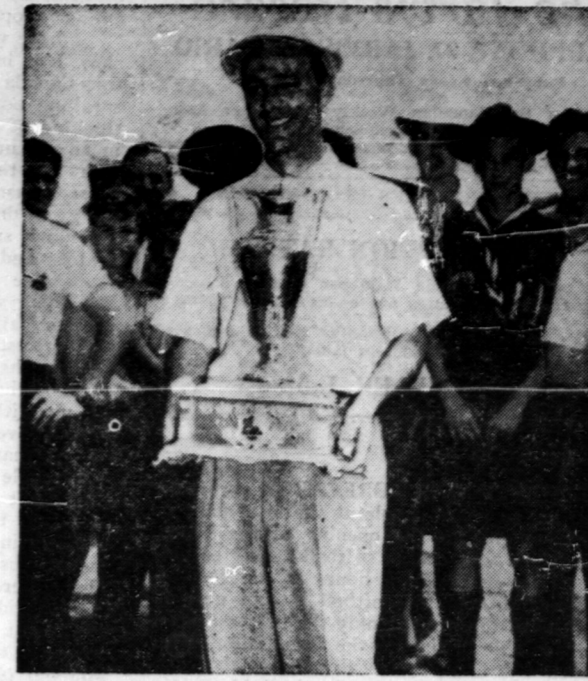
George Fazio of Los Angeles holds the Seagram Gold Cup, emblematic Canadian golfing supremacy, after a single stroke victory over Dick Metz of Chicago in an 8-hole playoff. Both finished regulation rounds of the Canadian Open Golf Championship over Montreal Beaconfield course with scores of 87.