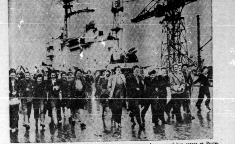
Famed British aircraft carrier "Indefatigable" starts the most unusual voyage of her career at Portsmouth, England. She is carrying 100 brides of Australian and New Zealand servicemen to their new homes "down under."