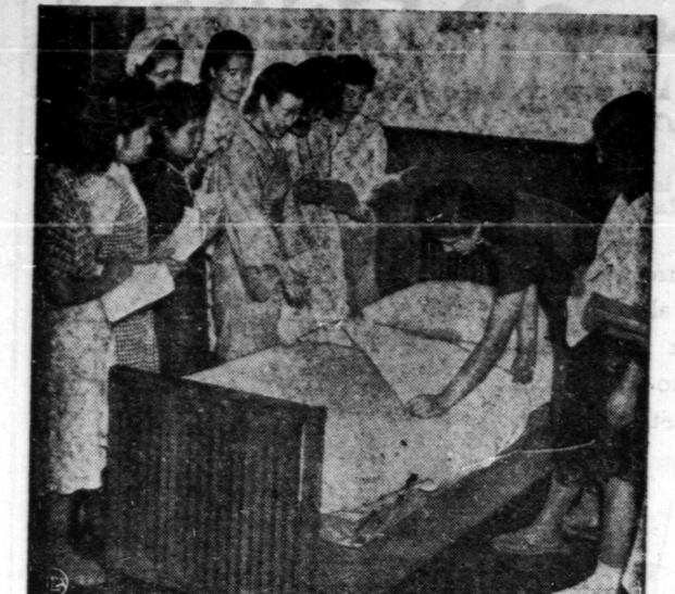
Students learn how to make a bed American style, with carefully squared "hospital" corners on sheets and blankets.

To make living smoother for American servicemen and their families in Japan, U.S. authorities, aided by the Japanese Foreign Ministry, have opened a training school in Tokyo where girls are graduates. The 100 students take English lessons, learning American cooking, the best service and general housekeeping techniques. A girl must successfully complete the one-month course before she can work as a housemaid. Photos below show typical scenes at the school.