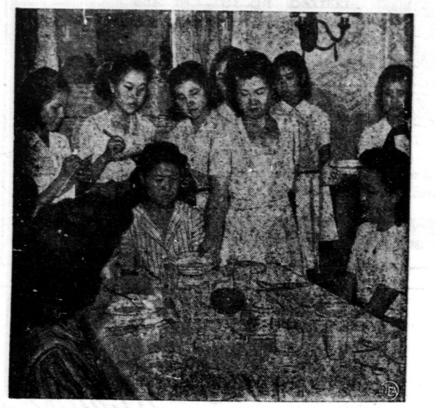
"Always serve from the left," says the instructor as she shows how an American style table is set and the meal served.