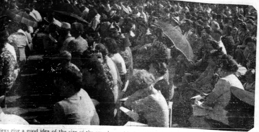
These views give a good idea of the size of the crowd seated in front of the bleachers and in the ball diamond area.