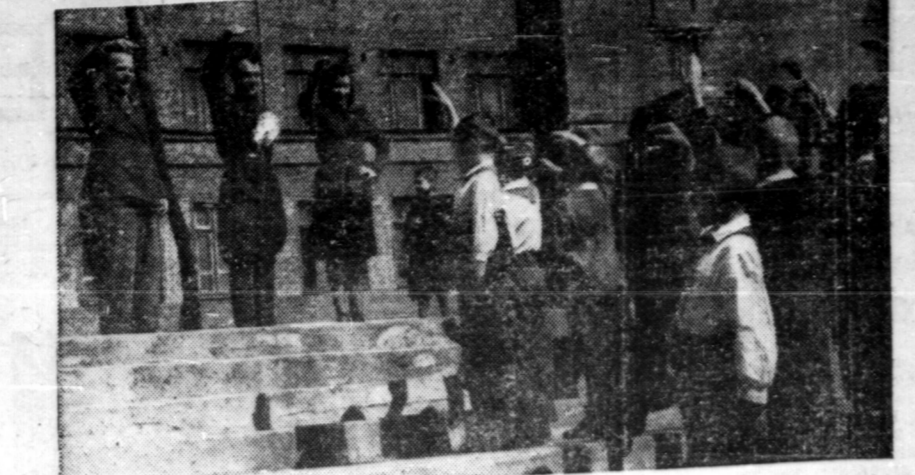
Vacation Time Again! —The Russian child is no different than Canadian moppets or young people in any country in the world—he's happy to wave goodbye to school this year and at holiday's come. School ended for the first three grades in Moscow early this year and at noon of May 19, the children cheerily waved goodbye to "pencils and books and teachers' looks."

Used as Museum The Nazis Oswicim (Anaschitz) Extermination camp was opened by Premier Josef Crankiewicz as a national memorial dedicated to the 4,000,000 persons said to have been killed there.