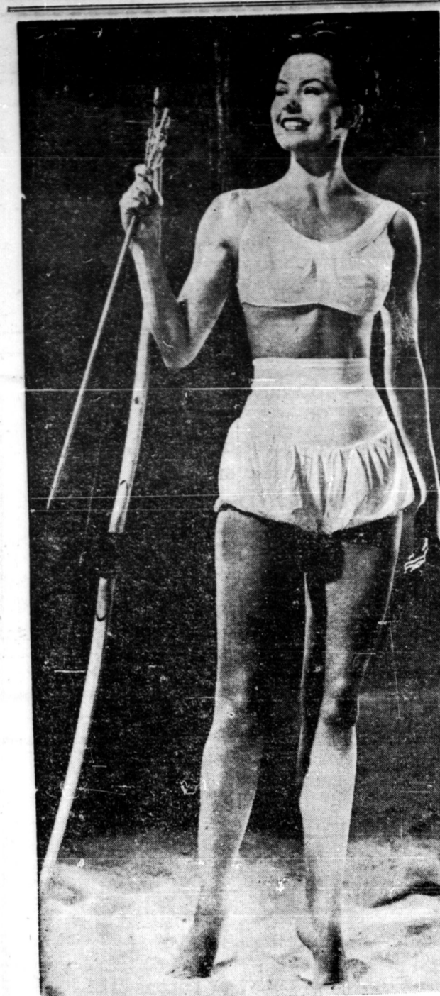
A Bathing Suit That Swims—If you are looking for a bathing suit that is not only something to decorate the beach with, but also doesn't get in the way if, as and when you get into the water, try one like this. It is worn by Cyd Charisse who shows it off to advantage in a new movie called "Fiesta."