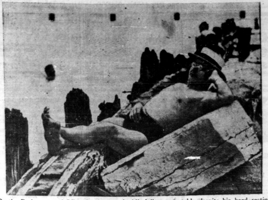
On the Rocks... and Likes It—Apparently blissfully comfortable despite his hard resting place, this straw-hatted bather reclines atop some shore-line rocks and enjoys a sun bath.