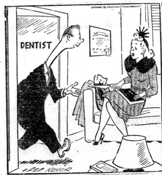
"For a minute I thought he was going to pull my head off!"