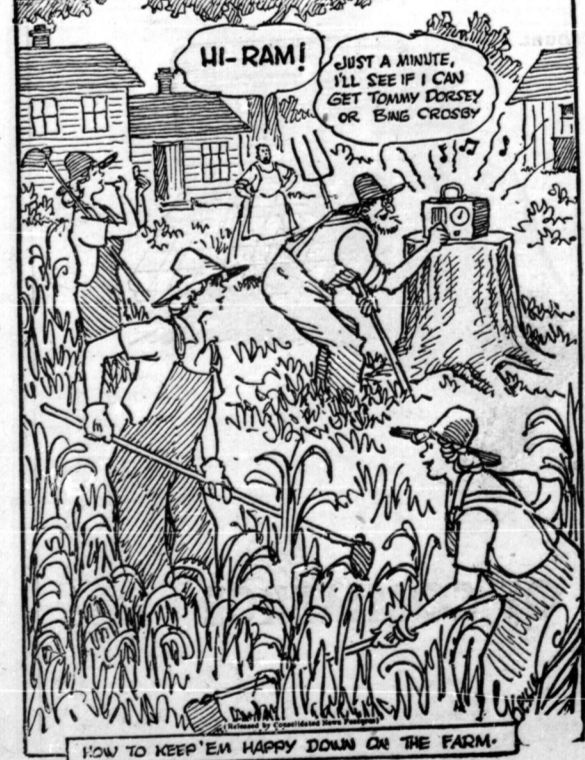
HOW TO KEEP 'EM HAPPY DOWN ON THE FARM.