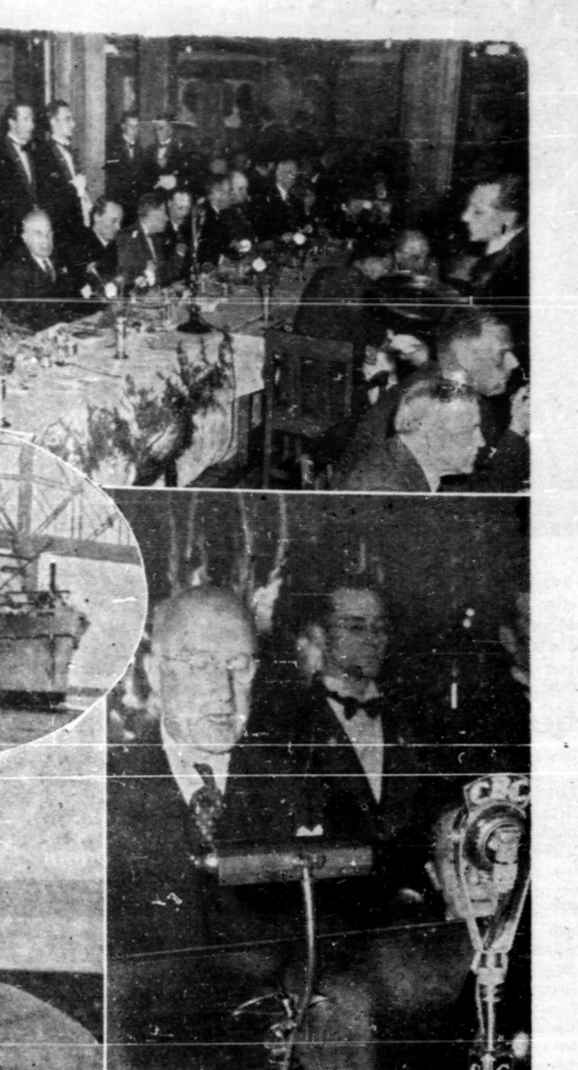
When the passenger liner Empress of Canada sailed under Jacques Cartier Bridge spanning the St. Lawrence at Montreal on July 23, regular passenger service between Montreal and Quebec was resumed by the Empress of Canada.