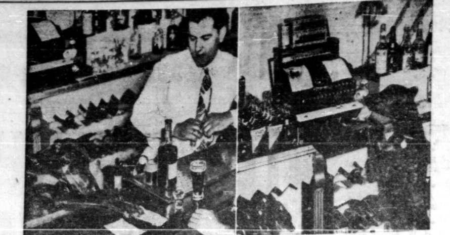
Animal Fare—Bartending in Chicago is going to the dogs, as evidenced by these pictures of Baron, a Doberman Pinscher, as he waits on customers in his owner's tavern.

STUFF AND THINGS OUT OF THIS WORLD "Come, come! A good brisk walk will put new life in you!"