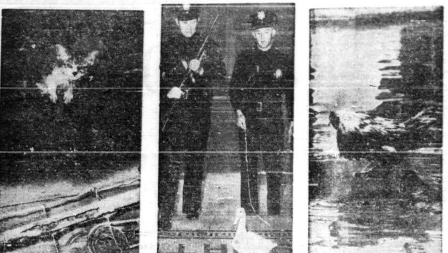
Cop who found this duck strutting down busy street in Los Angeles, Calif., gets armed escort as he takes it to Leath, Mo., as flood waters swirl around it below.

Shipping Losses on Great Lakes Sharply Reduced in Recent Years