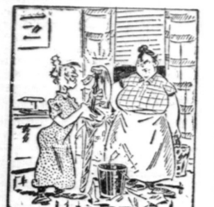
"Mrs. McGillicuddy! Are you having an affair with the superintendent?"

Woman A woman may put on a riding habit and never go riding. She may doll up in a sking outfit and never go skiing.