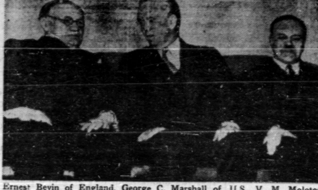
Ernest Bevin of England, George C. Marshall of U.S., V. M. Molotov of Russia, and Georges Bidault of France.

Better To Help Turkey Now Than Rescue Her Later Qualified informants in Istanbul say Turkey must have American financial aid to keep its army of nearly 1,000,000 men fully mobilized as a barrier against possible Russian encroachment.