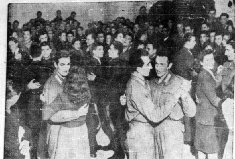
Something new has been added: In Fascist days Italian soldiers had to dance with each other; girls weren't allowed in troop halls. Now they can bring their seniors, but there doesn't seem to be enough to go around.

Rome.—There was one good result of the war in Italy. GI Giuseppe now can sit down at a table to eat his meals.