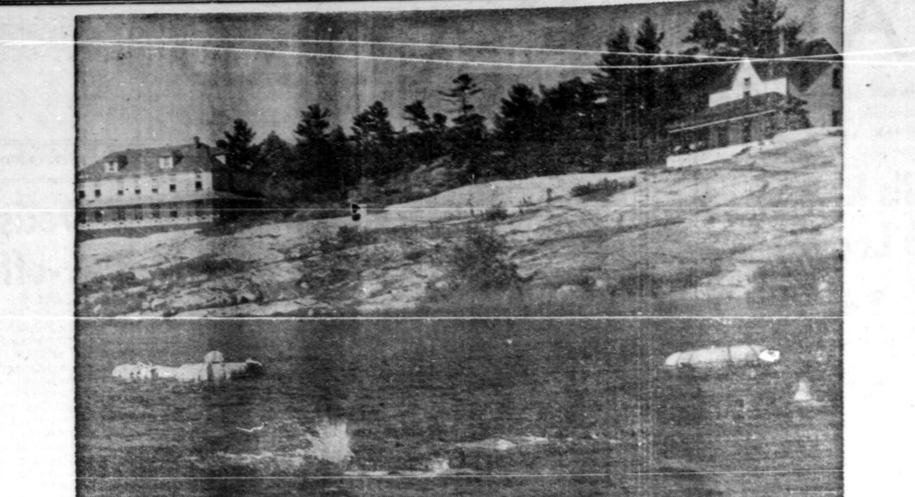
Making a Big Splash—That froth you see on the otherwise clear waters of Georgian Bay is not caused by a high wind, but by a bunch of Sea Cadets taking part in a swim class at the Princess Alice Camp on Minnick Island. This is one of the Georgian Bay Camp—Queen Elizabeth on Bensalott Island—are two of the Navy League's ten camps which have been in full swing across Canada recently.