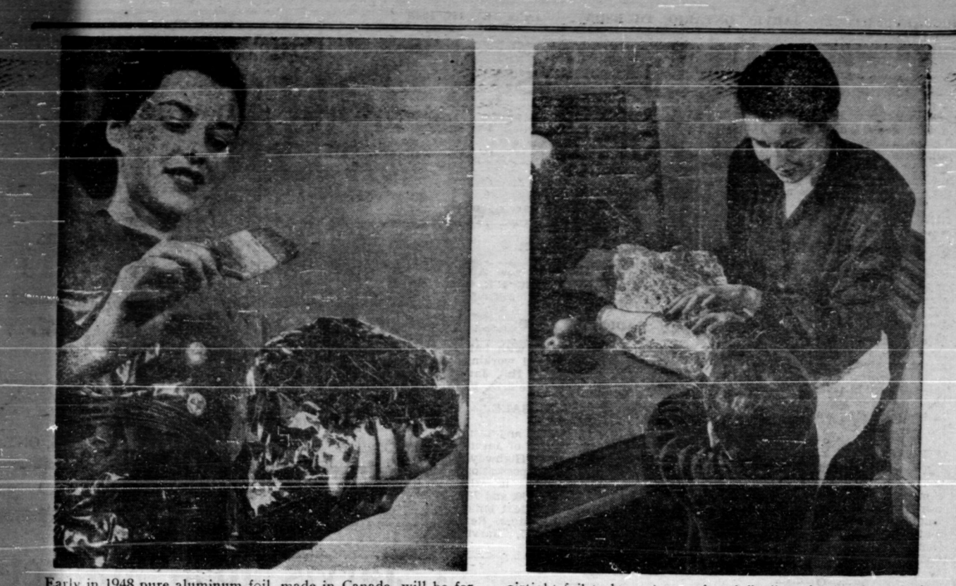
Early in 1948 pure aluminum foil, made in Canada, will be for sale in 10-inch widths in Canadian stores. Its uses are many and varied. Paint brushes can be cleaned and wrapped in the airtight foil to keep them soft and flexible; for lunches or picnics it keeps sandwiches fresh and soft drinks cool. Packaging is easy, as on string or fasteners, as needed.

Keeps in the cupboard Wonderful new! New Fleischmann's Royal Fast Rising Dry Yeast is here—ready to give you perfect rising, delicious breads in super-speedy time. No need to keep it in the icebox—New Fleischmann's Royal Fast Rising Dry Yeast stays fresh in your cupboard for weeks. Always there—ready for work when you need it, just dissolve according to directions. Then use as fresh yeast. IF YOU BAKE AT HOME—order a month's supply of New Fleischmann's Royal Fast Rising Dry Yeast from your grocer. Once you try it—you'll always use it.