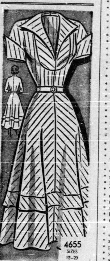
4655 SIZES 18-20 Anne Adams

"Of course there are always some girls waiting for the question. But I am very particular about the girls I choose to go out with. I want to be married, not waste my time on some silly girl."