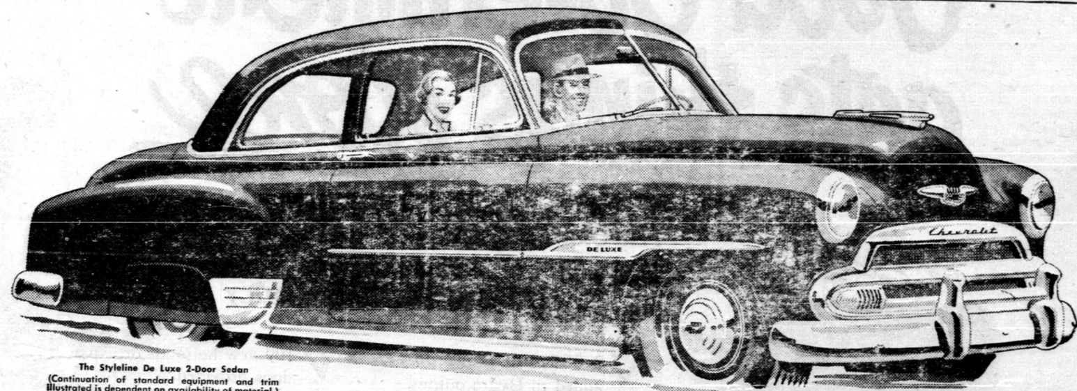
The Styline De Luxe 2-Door Sedan (Continuation of standard equipment and trim throughout is dependent on availability of materials.)

Yes... largest in its field! Yes... finest in its field! Yes... lowest priced line in its field!