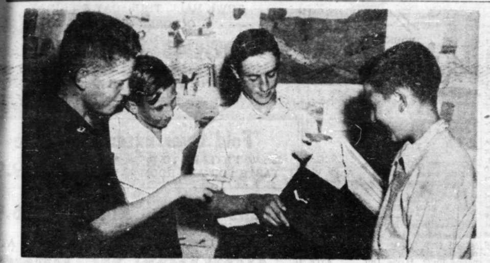
Schomberg, Ont.—Four of the Schomberg boys take a good look at the prize-winning Bird House.