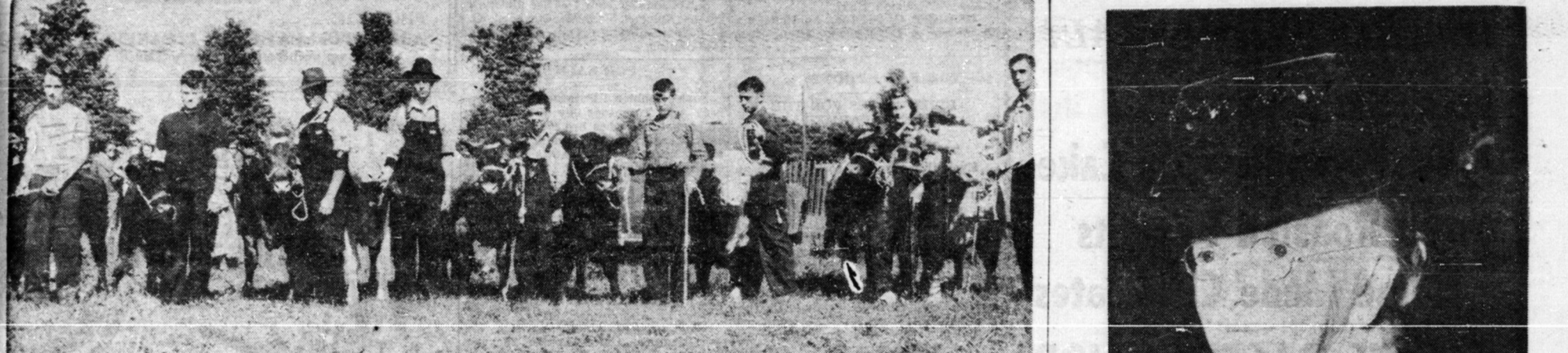
Blyth, Ont.—All Lined Up—These youthful farmers, and the one young farmerette, are members of the Belgrave Calf Club, Beef Section.