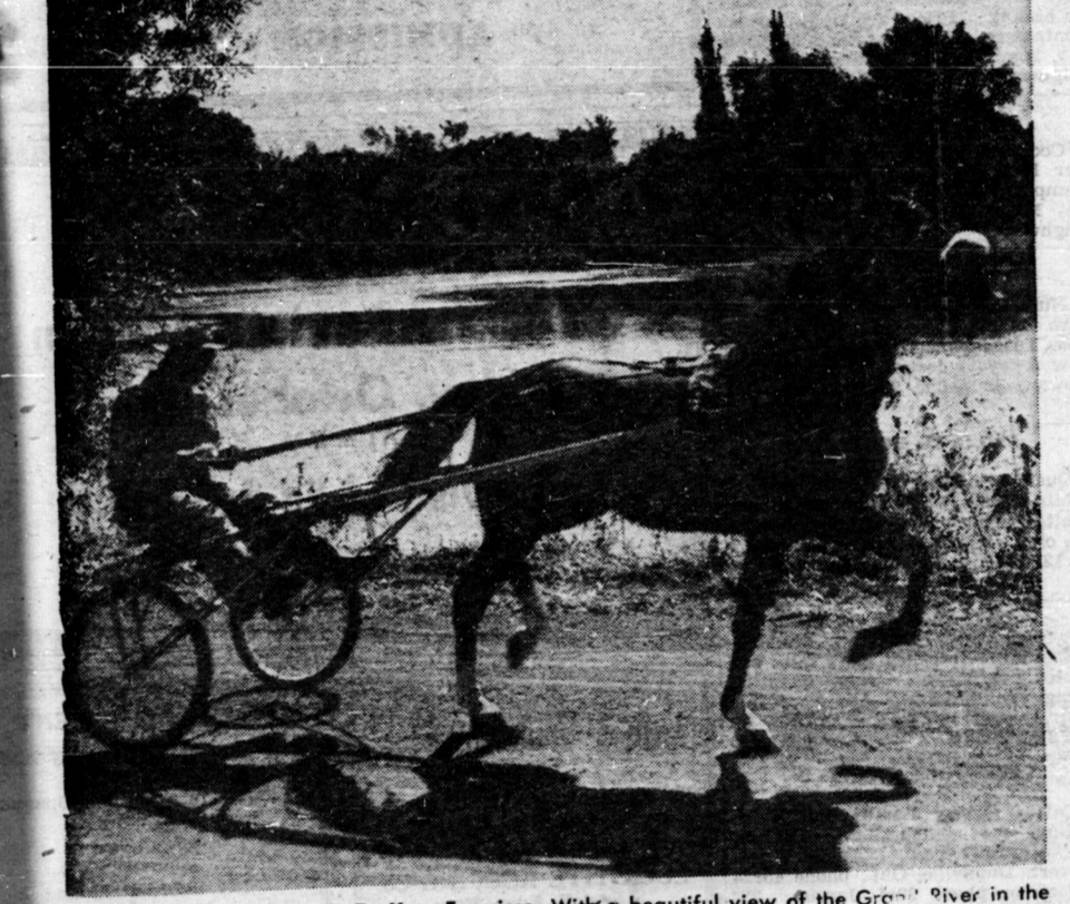
Caledonia, Ont.—Nice Place To Do Your Exercises. With a beautiful view of the Green River in the background, a pacer limbers up in preparation for the afternoon's events.