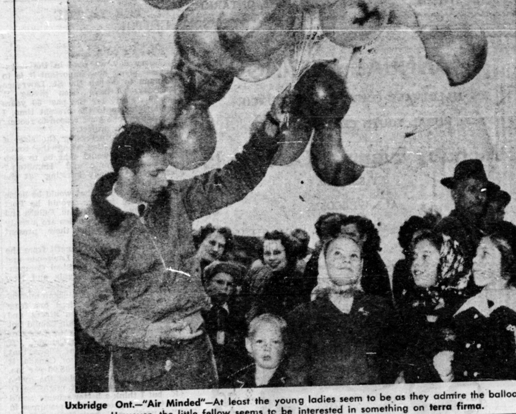
Uxbridge, Ont.—"Air Minded"—At least the young ladies seem to be as they admire the balloons. However, the little fellow seems to be interested in something on terra firma.