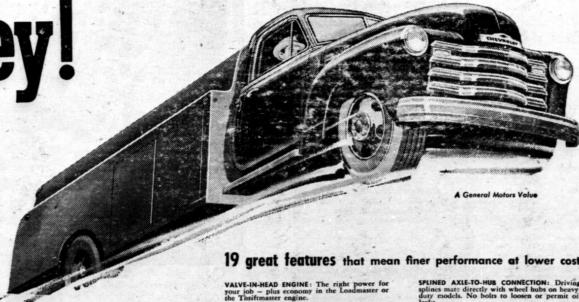
A General Motors Value

You can't buy a better truck to save your money!