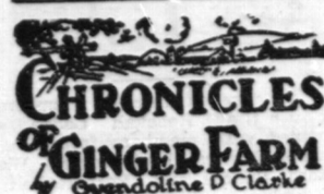
CHRONICLES GINGER FARM Quebec, Ontario