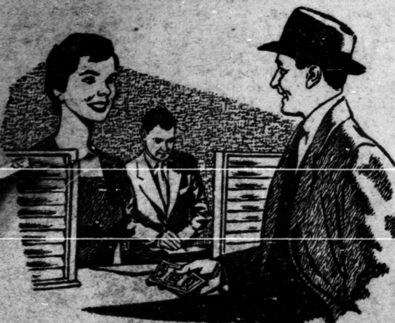
Today's bank is a bright, pleasant, informal place, where service is both efficient and friendly.