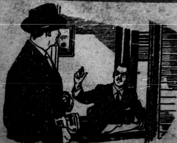
The manager's door is always open—his experience, knowledge and judgment will be useful to you.

Nowadays people drop into the bank as casually as into the corner store. The neighborhood branch is an integral part of the life of the community. The 4,000 branches... Canada's chartered banks make available an all-round, nation-wide banking service—a friendly personal service keyed to Canadian conditions and the everyday needs of millions of customers.