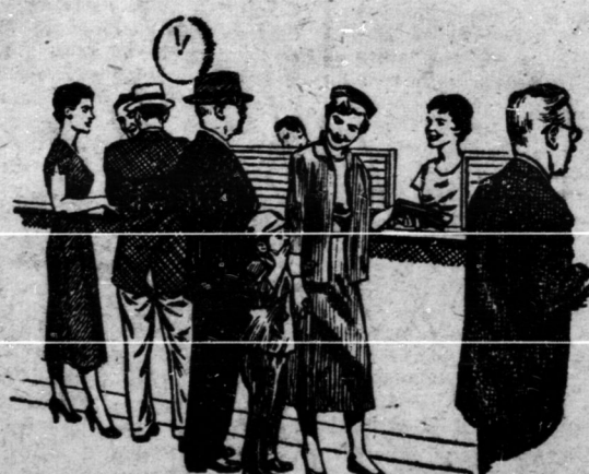
People use the bank for many purposes—to deposit savings, arrange loans, buy travellers cheques...