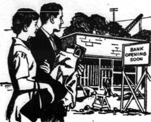
As communities develop, banking services are made available to meet new and growing needs.

Banking in Canada works in such a way that your local branch manager brings you all the resources, knowledge and experience of the bank he represents. It has branches throughout Canada and provides contacts the world over. The benefits of this branch banking system, developed to meet Canadian needs, are demonstrated every day by the quality and scope of your local banking service.