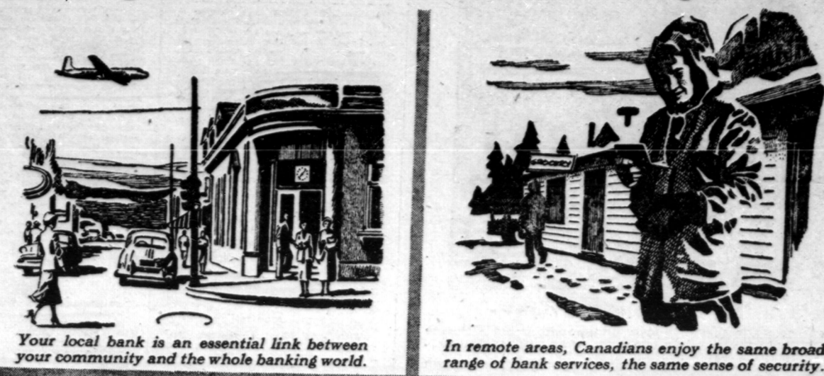
Your local bank is an essential link between your community and the whole banking world.