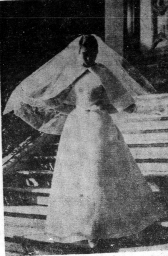
ABANDONING THE JEUNE FILE LOOK for sophistication, Hubert de Givenchy employs an unusual, deep-layered texture of 100 per cent nylon for his bridal gown, the high point and finale of all couture collections. Double volume to give a rich contour of effect, this elegant fabric is cut on restrained lines. The elbow-length cape covers a snug-fitting bodice.