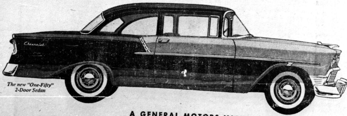
The new "One-Fifty" 2-Door Sedan