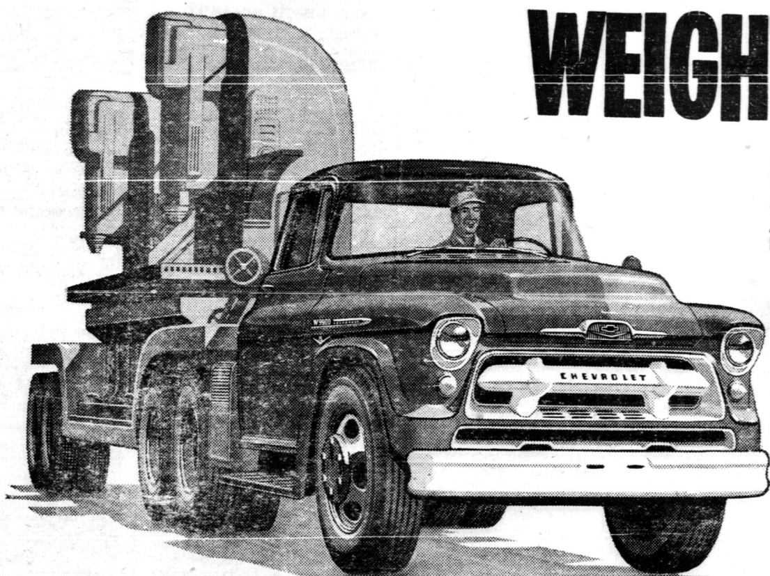
Rugged, Big, Tough New Tandems

New models do more and bigger jobs! New power right across the board—with a brand-new big V-8 for high-tonnage hauling! Take a look at the modern advantages they offer.