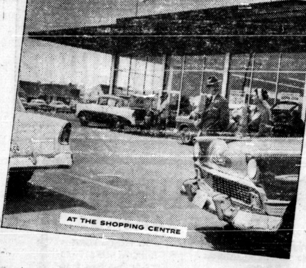
AT THE SHOPPING CENTRE