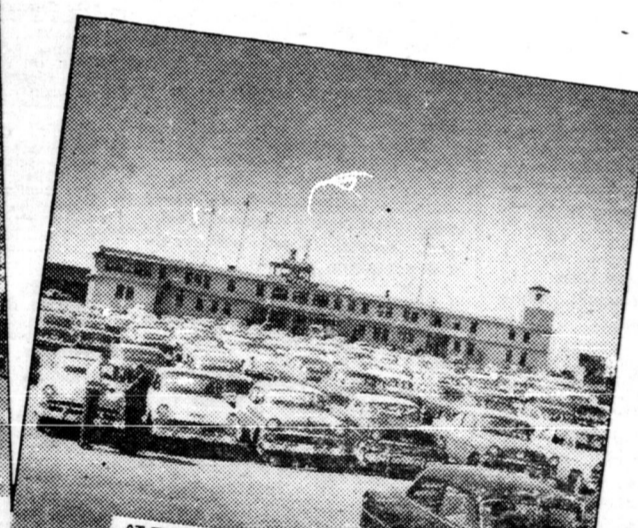
AT THE AIRPORT