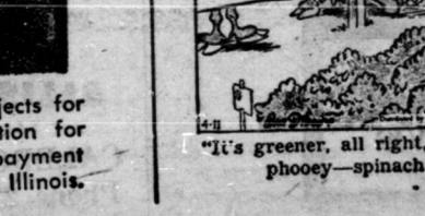
"It's greener, all right, but it's phokey-spinach!"