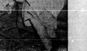
"It's greener, all right, but it's phokey-spinach!"