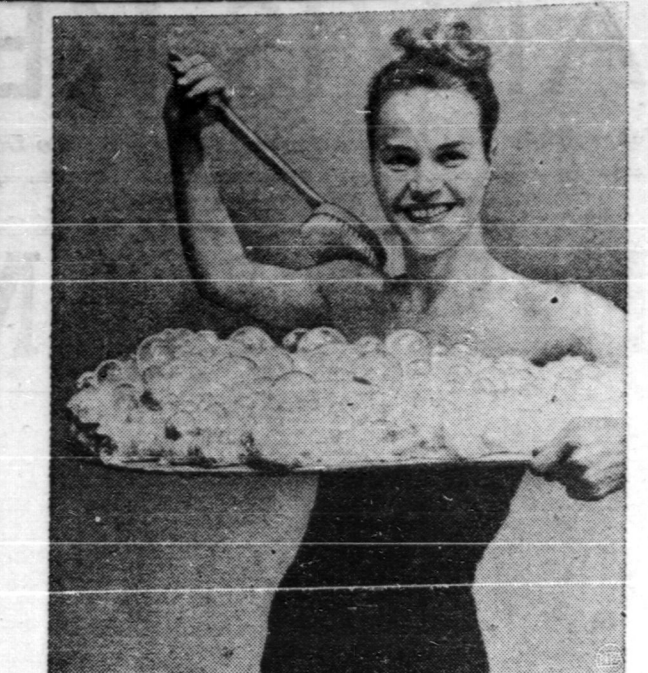
BROKEN BUBBLES —Someone's always taking the joy out of life and across too strong, above, is no exception. In a New York rehearsal she demonstrates how a girl takes a bubble both on the screen, just cover up the bottom half of the picture.