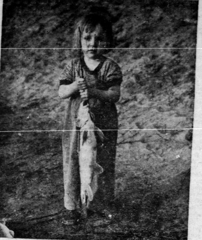
DADDY NETTED THIS ONE—Sucker fishing time finds dip nets one of the ugly but edible coarse fish caught at Alliston, Ontario.