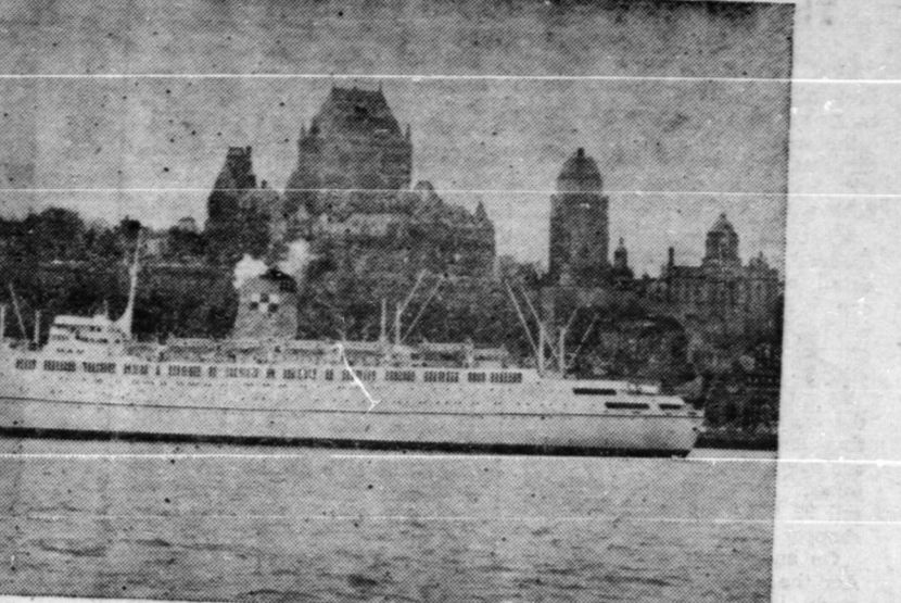
EMPERESS OF ENGLAND: The Canadian Pacific's new 25,500-ton "Empress of England" sails past Quebec City with one of the ancient capital's most famous landmarks, the Chateau Frontenac Hotel, in the background.