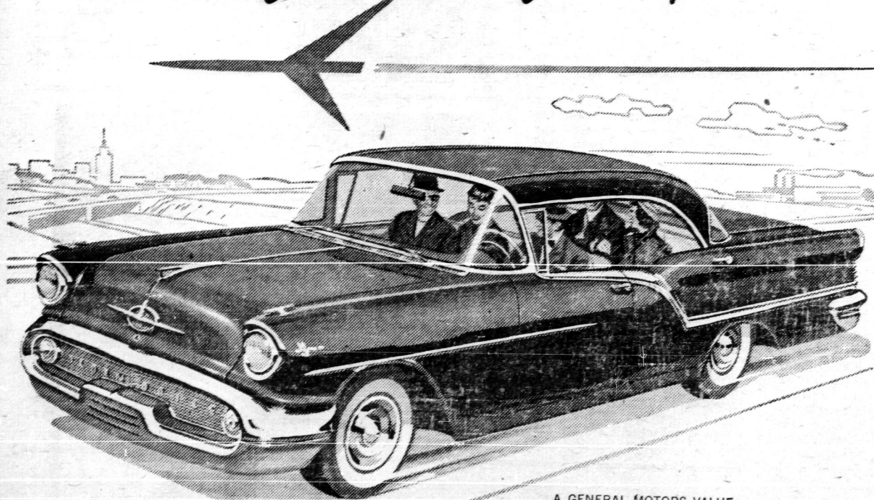
A GENERAL MOTORS VALUE

Be Our Guest!... TAKE A ROCKET TEST! DRIVE OLDSMOBILE'S SPARKLING SUPER 88!