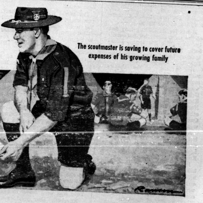
The scoutmaster is saving to cover future expenses of his growing family