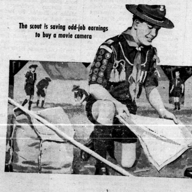
The scout is saving odd-job earnings to buy a movie camera

Each has a different objective, but both are working on the same idea: that to get ahead it is important to save ahead, too. Your reasons for wanting to build up your bank account can be as varied as human hopes and needs... a vacation, your child's education, a new rug, camera equipment; or simply the deep satisfaction and sense of security that a cushion of ready cash creates. A chartered bank is a convenient place to keep your savings safe, and to keep them growing. Whether your account is large or small, the trained and friendly staff is there to take care of all your banking needs. Save at a bank — millions do!