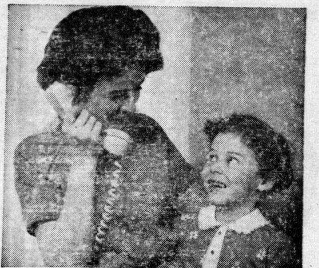
"Yes, Doctor... Wednesday will be fine!"

GET YOUR TICKETS NOW ON THE JARVIS LIONS CLUB MAY 24th DRAW!