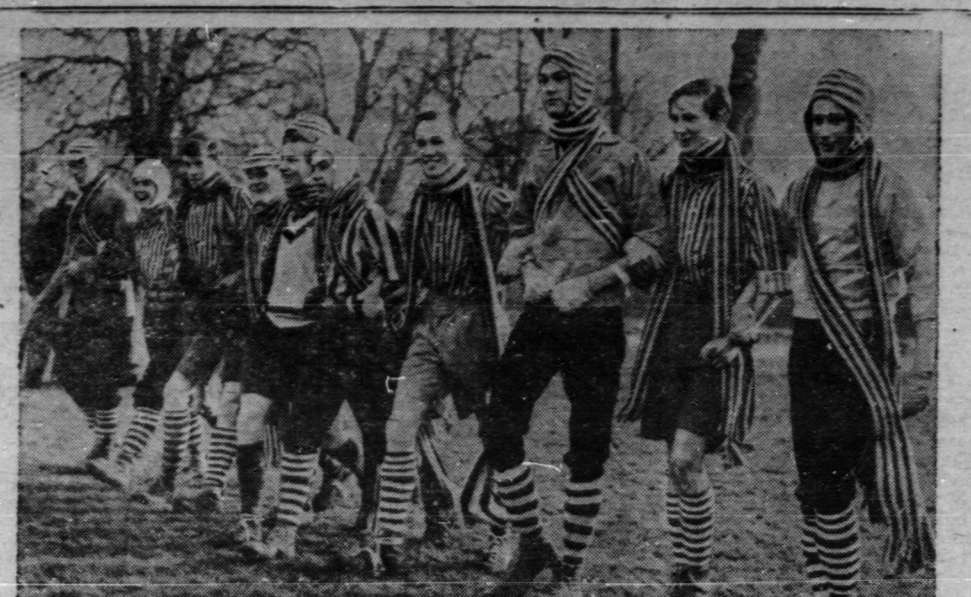
THE OLD WALL GAME-Stripped and ready for battle, the Collegers stride onto the field of Eton...