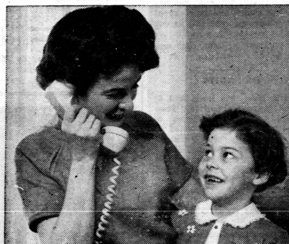
"Yes, Doctor...Wednesday will be fine!"

DIRECTIONS—Take Nanticoke or Kohler Road, off No. 3. Lots of Fun and Away from Heavy Traffic.