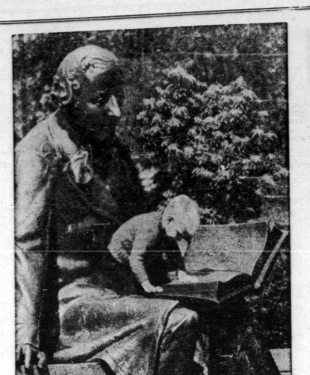
CHILDREN STILL LOVE HIM - A bronze statue of Hans Christian Andersen with an open fairy-tale book offers an irresistible combination to a small boy in Central Park.

Q. If you are invited to a dinner party, should you accept the invitation if you are unable to attend?