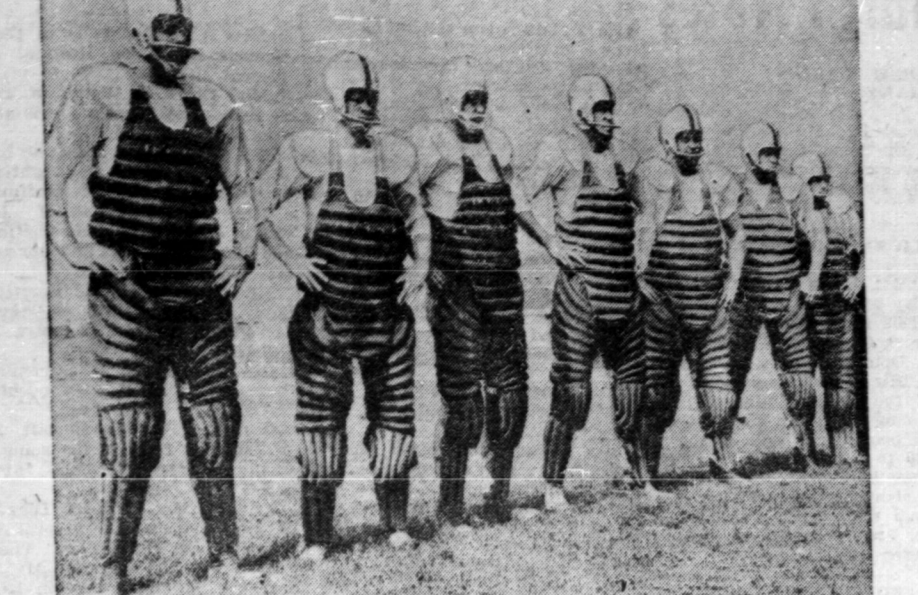
PROTECTION PLUS - Wearing protective gear similar to that of baseball catchers, Buicklin University linemen get set for a workout. The padding enables the coach to send them into heavy contact drill early in the season.

SHAW SCHOOLS Investigate how Shaw Schools will assure your success in any business career. Bookkeeping, Cost Accounting, Stationary Engineering.