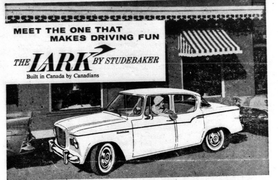
Here's 14 1/2 feet of pure pleasure. Parks proudly (and easily!) in the poshest places, has a personality all its own. Livelier, lovelier, lower in cost—seats 6 in comfort—gives marathon mileage on regular gas. Available in V8 or 6 cylinder models. An exciting combination of sense and sophistication. Drive it and see.

and finished the House of God, they offered offerings unto their Lord with joy and with joy they purified themselves. On this last point he made it clear, that for the people of a church to have an effective testimony in a community, they must be separated from all the defilements of sin, and keep from compromising with things which are contrary to the Word of God.