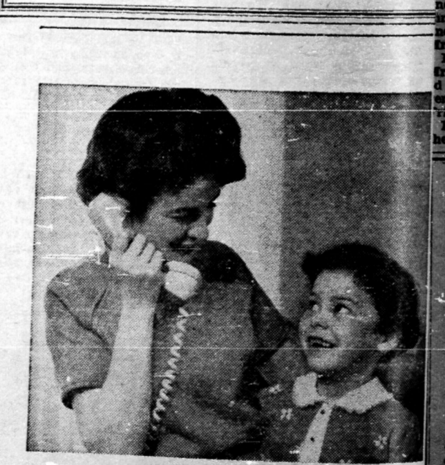
"Yes, Doctor... Wednesday will be fine!"

D. Kindy & Sons Ltd FURRIERS since 1866 SELKIRK, - Phone 36W - ONTARIO