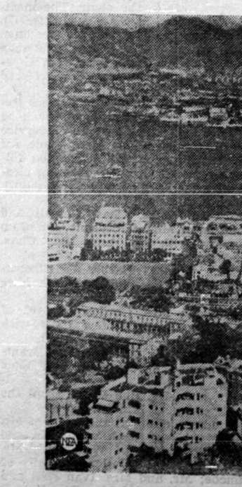
HONG KONG: Mao needs this window for ventilation.

dozens of all these recipes even though thousands rely on us for visas. Careful scrutiny shows that many of them are Red agents in disguise. With trade in goods down and the export of people up, Hong Kong should be in a severe depression. But Mao — "best of the Free World, Best of the Free World, Best of the Free World" — has seen to it that his show window on the Red is kept in good repair. Foodstuffs grown and raised in Red China flow across the border to keep famine and drought from Hong Kong. A water pipeline from the Red runs through the border to keep famine and drought from Hong Kong. A water pipeline from the Red runs through the border to keep famine and drought from Hong Kong. With trade from industrialized China down, Hong Kong has been forced to industrialize — heavily that is. It is now a heavy industry, a heavy industry, a heavy industry. It is now a heavy industry, a heavy industry, a heavy industry. We used to have meeting places. We'd break up, come evening, with an agreement to meet at "Number One" — this was a monstrous great red oak in the lower plains. It stuck up so high the pine limbs crowded round it, and gave the effect of being a red oak trunk with pine limbs. That was Number One. When we built our house I cut