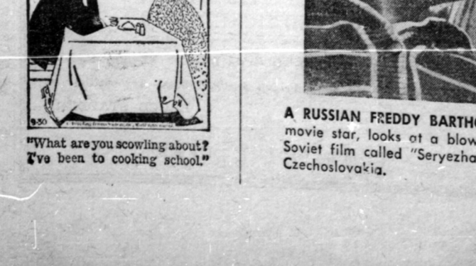
What are you scowling about? I've been to cooking school!