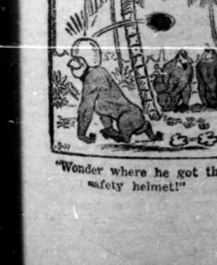
Wonder where he got the safety helmet!