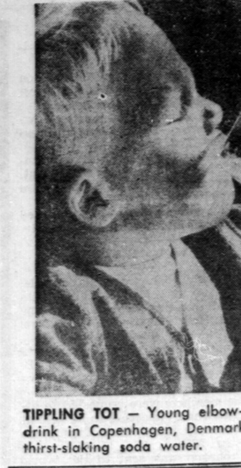
TIPPING TOP — Young elbow-bender toasts off a man-sized drink in Copenhagen, Denmark. Nothing alcoholic here. Just thirst-slicking soda water.

ONE LITTLE, TWO LITTLE INDIANS — Two of the Indian children attended in-down in an all-white high school in Dunn, N.C...'