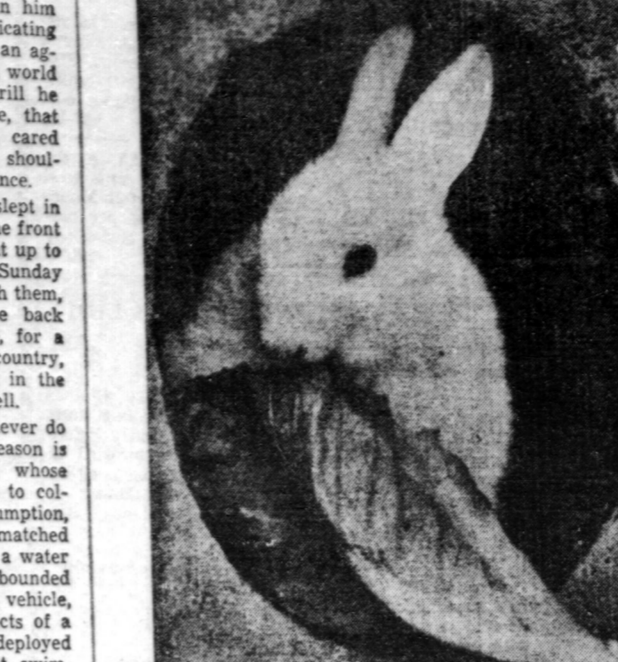
CONTENTMENT — Baby bunny nibbles his way through a lettuce leaf. The little rabbit lives in a London drain pipe.

Michigan's cherry growers now are shaking big problems out of their trees...'