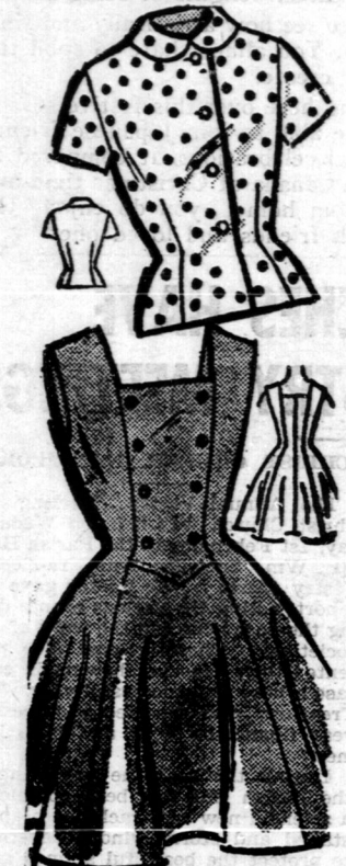
4603 SIZES 6-14 by Anne Adams

Easy princess jumper and blouse — the warm, bright fashion school set loves best. Contrast-button trim creates a double-breasted effect.