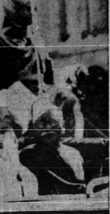
FIRST TIME IN FIFTY YEARS — Queen Elizabeth II waves to crowds as she rides through the streets of New Delhi, India. She is the first British monarch to visit the nation in half a century.