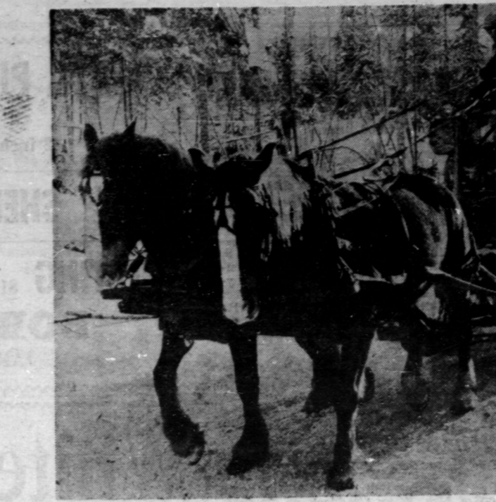
AND STILL THE BEST - The old way sometimes is hard to improve upon. This team hauls pulpwood from the woods near Clayton Lake. The horses can go where mechanical equipment fears to tread.