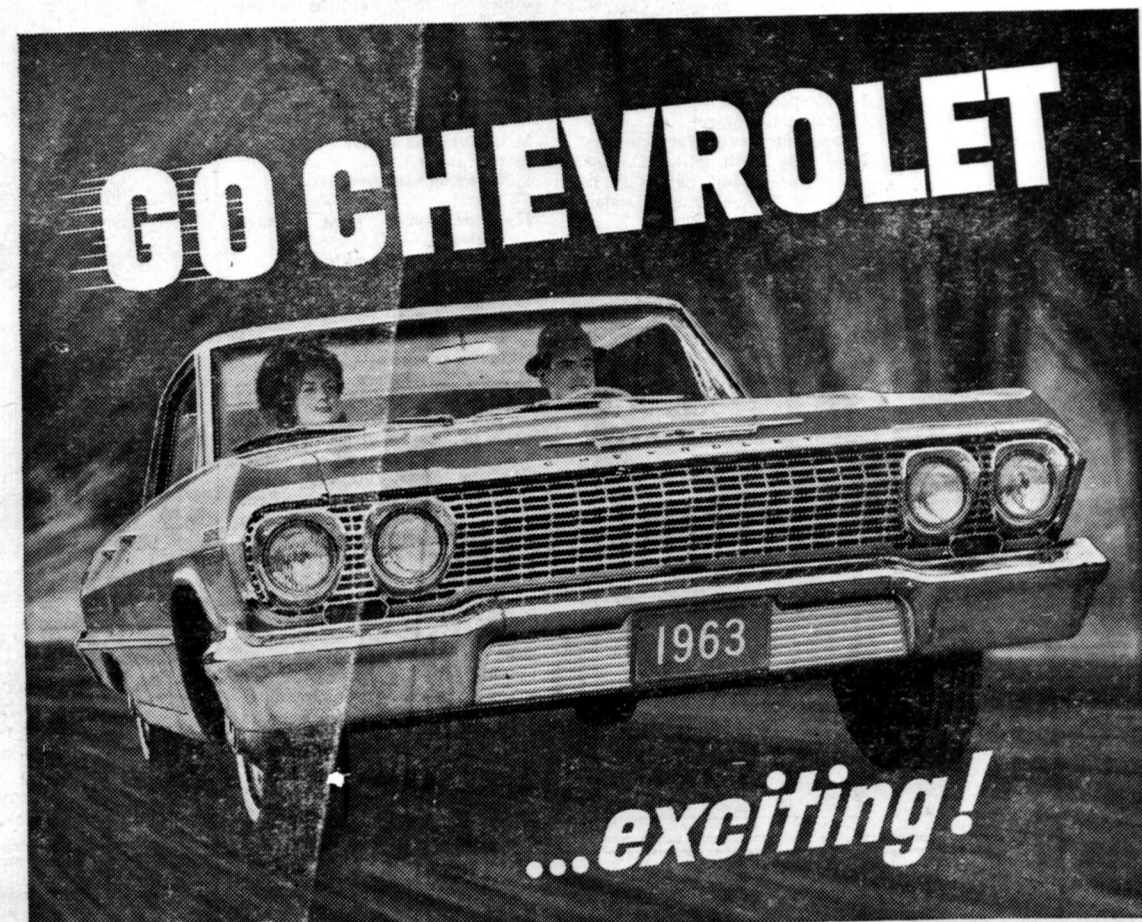
A General Motors Value Chevrolet Impala Sport Sedan

The West Haldimand Hospital, c/o Village Clerk, Hagersville, Ontario