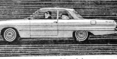
Chevrolet Biscayne 2-Door Sedan