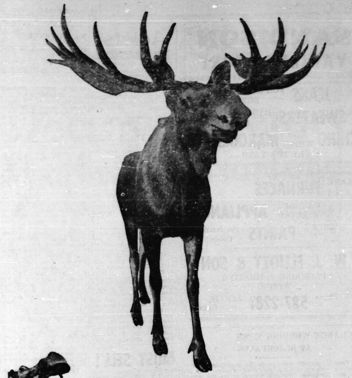
"Everyone's switching to Canadian products"