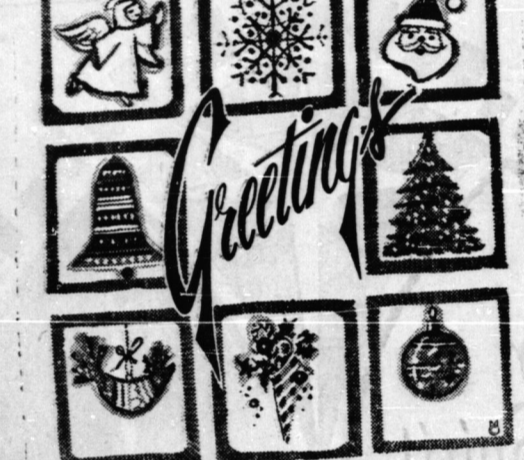
We're wishing all of you every joy of the Holiday Season. May your days be merry and bright... seeing you has made ours a delight!

POINSETTAS, CYCLAMENS, MUMS and AZALEAS for Christmas VI-MAL FLORISTS RADICAL ST. JARVIS, Ont. Phone 587-2191