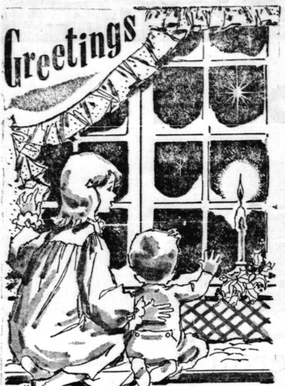
It's time again to wish our good friends all the enchantment, every excitement and wonder that the Christmas Season can bring... and to express our sincere appreciation!

Yes! Christmas is Commercialized. Yes! Postage has increased. Let us still rejoice in the Spirit of Christmas and the Birth of our Saviour. Let us feel it in our hearts to send a cheer to Christmas and shut-ins. It costs so little and means so much.