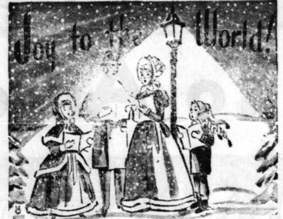
Best wishes to all for a joyous Christmas.