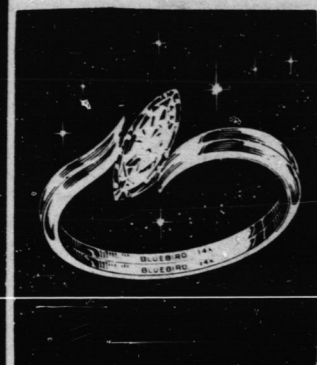
STYLE 302 370 MARQUISE — SET FROM $275.00

BLUEBIRD AND LOVELACE All Prices Available