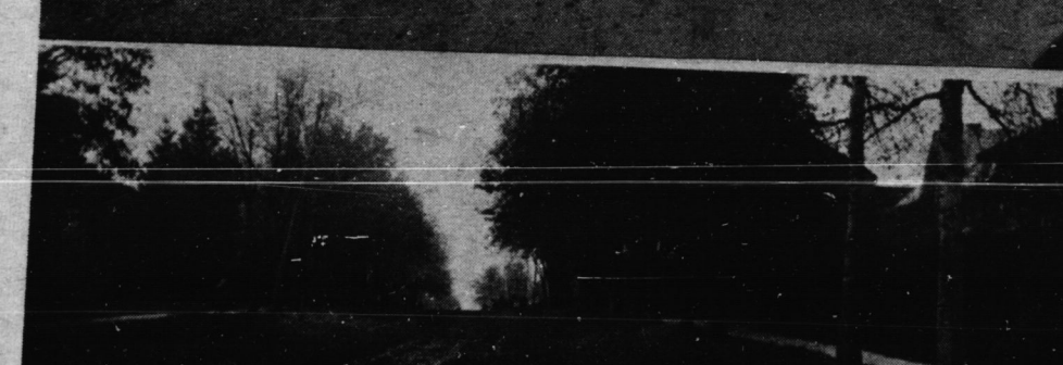
TALBOT STREET EAST, JARVIS, CANADA

Here we have the same views of two different time periods of Jarvis. At upper left we have a look at Main Street North as seen today and at lower left the same view some