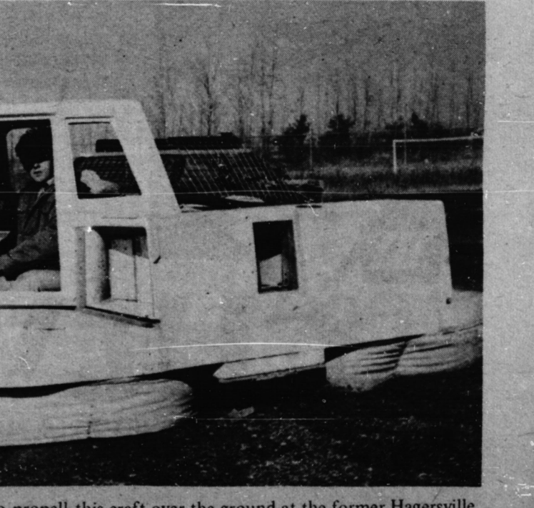
A cushion of air is used to propel this craft over the ground at the former Hagersville airbase. The craft, being built there, was tested earlier this week.