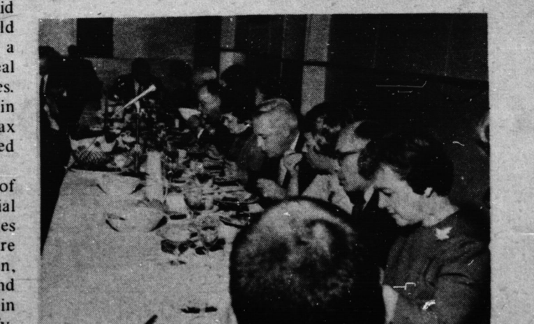
Guests at annual Warden's banquet enjoy their dinner.